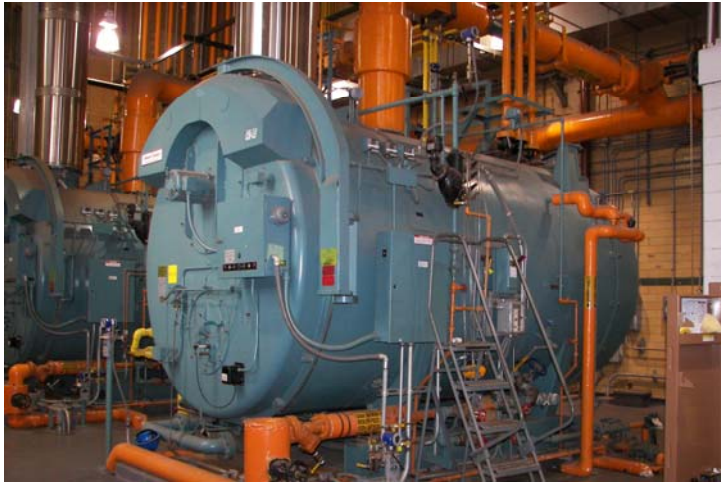
EFFICIENCY LOSS DUE TO SCALE DEPOSITS

Hydro-Zone's Water Management will Save Water and Energy Costs while